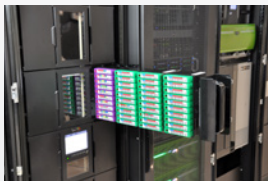
Loading 40 tapes at a time

Your data is critical to your business, but it can be expensive to store all your data. Tape is known for its affordability and Spectra Stack utilizes LTO tape media, a high-capacity tape storage technology designed for dependability and cost effectiveness. It's a powerful, scalable and adaptable tape format that addresses the exponential data growth and storage challenges organizations face today – at the most affordable cost per GB in the industry. For as low as 1 cent per gigabyte, Spectra Stack delivers an extremely reasonable data storage option.