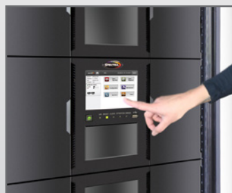
Convenient front panel color touchscreen

Easy to use and manage, the library's management software provides a similar feature set as the rest of the Spectra tape library family, including an intuitive color touchscreen, remote web interface, ability to create partitions (up to 20), built-in diagnostics, media lifecycle management, encryption, and encryption key management. An optional SpectraVision web camera can be mounted on top of the library to provide a visual assessment of all robotics and interior components.