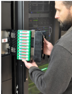
Loading ten tapes at a time