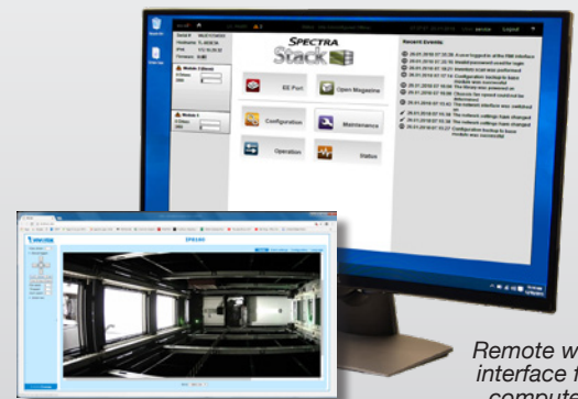
Remote web interface for computer